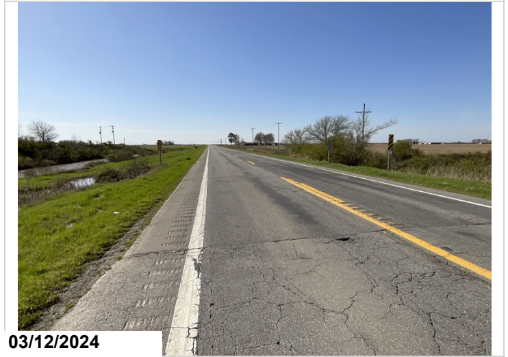
Approach looking south